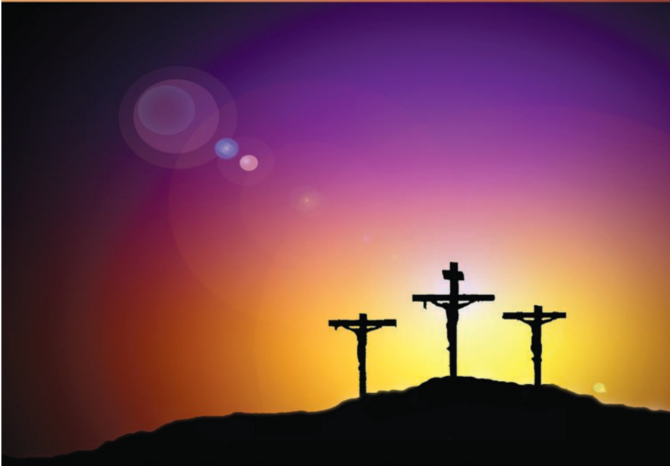
Cover design ©Liturgical Publications Inc.