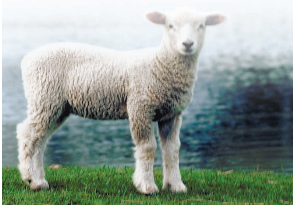
Excerpts from the Lectionary for Mass © 2001, 1998, 1970 CCD.

John the Baptist saw Jesus coming toward him and said, "Behold, the Lamb of God, who takes away the sin of the world. He is the one of whom I said, 'A man is coming after me who ranks ahead of me because he existed before me.'" — Jn 1:29-30