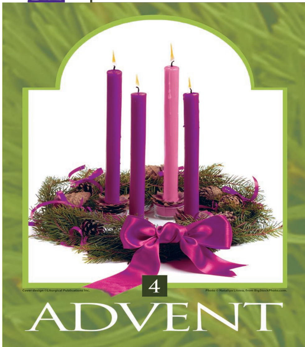
Cover design ©Liturgical Publications Inc.

Saturday 3:00 pm-4:00 pm. Todos los sábados de 3:00 pm a 4:00 pm